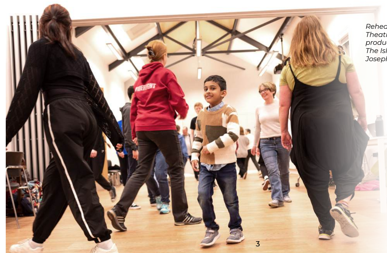
Rehearsals for the National Theatre Public Acts production of 'The Odyssey: The Island of the Sun'.