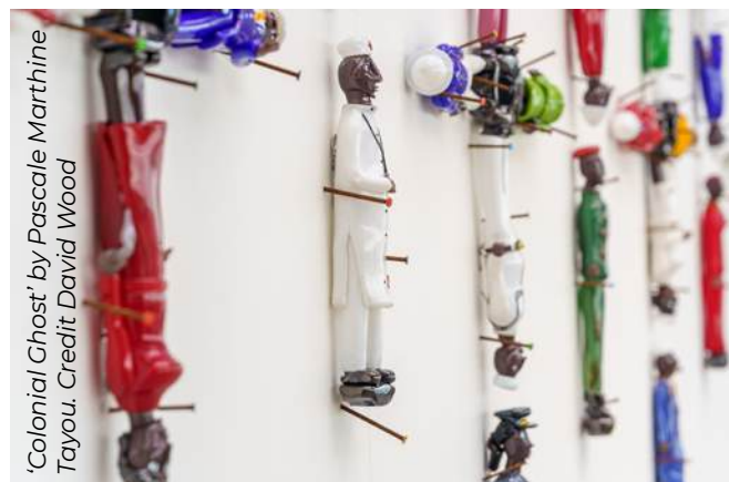
'Colonial Ghost' by Pascale Marthine Tayou.

As part of the Theatre Nation Partnership, Sunderland Culture began working with Sunderland Empire Theatre and the National Theatre to bring an exciting range of theatrical experiences to Sunderland audiences. This special partnership allows us to work together towards the common goal of bringing more exceptional theatre to Wearside.